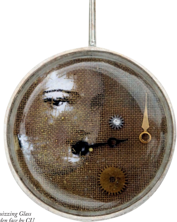
Quizzing Glass hidden face by CU

that I love to express." Gil adds that the renewal of loud colours is not just a concerted effort to overcome the crisis, it also signals change.