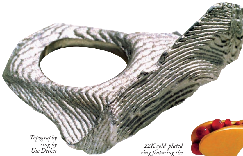
Topography ring by Ute Decker