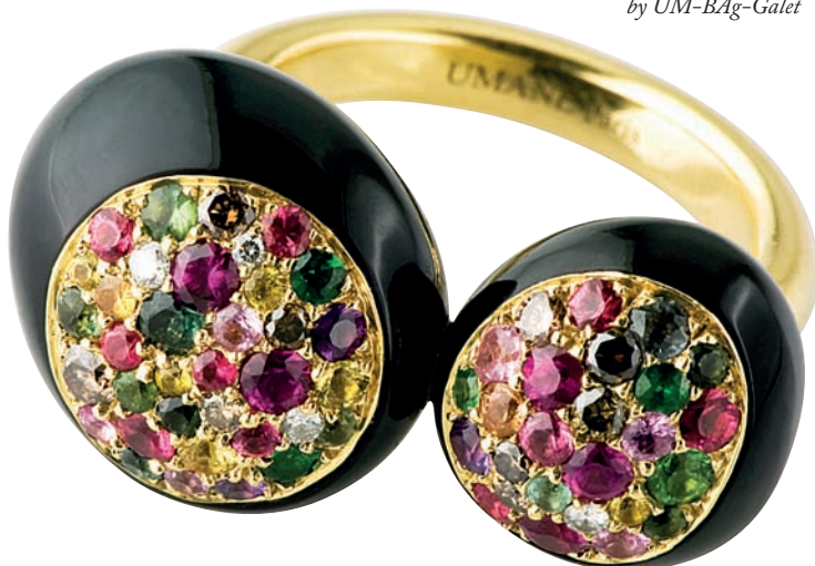
Gold ring with onyx and multi-coloured precious stones by UM-BAg-Galet