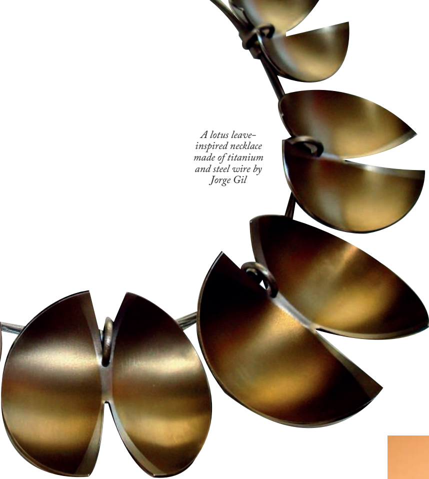
A lotus leaf-inspired necklace made of titanium and steel wire by Jorge Gil