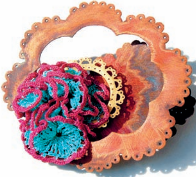
Cloud Busting brooch by Sally Collins